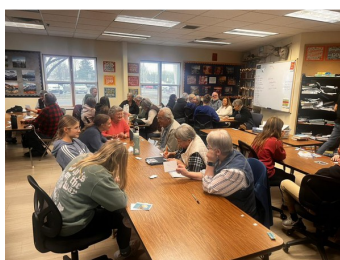
Grandparent/Special Friends Day