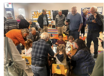
4K Kids enjoying their time with Grandparents/